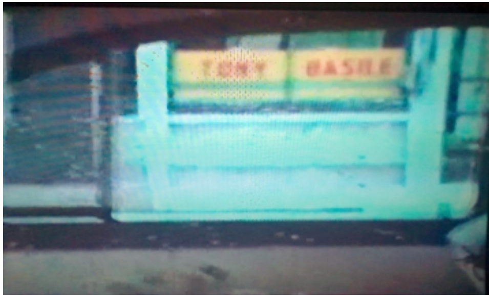
Tony Basile's Shoe Repair shop. Photo taken from car of newly married couple.