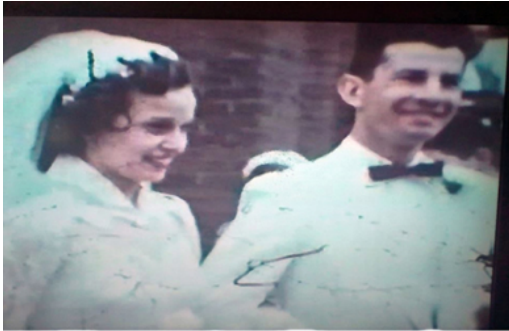
Unknown couple after wedding at St Mary's church