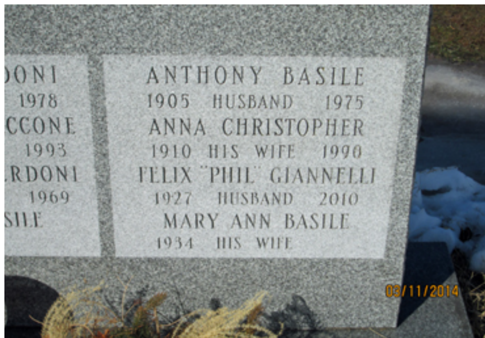
Basile Family Gravestone, St. Mary's Cemetery