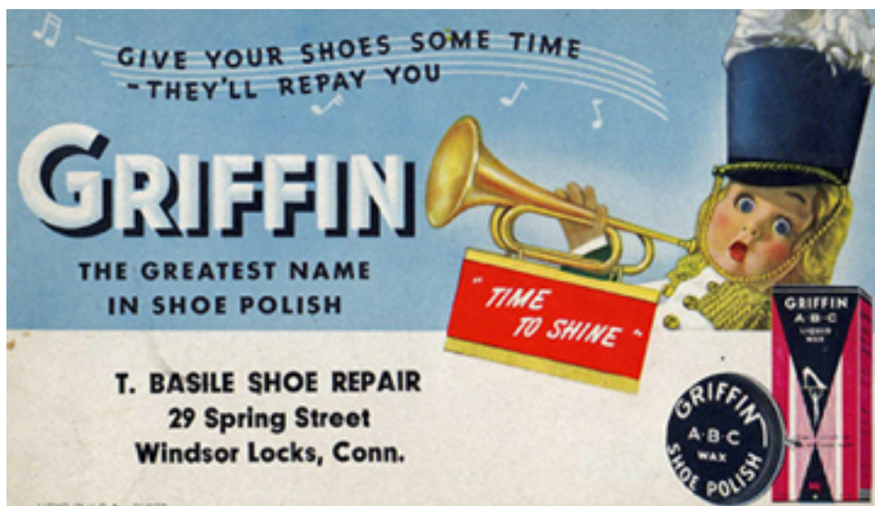
Tony Basile's advertising blotter

It was common in the 1930s and 1940s for small businesses to print up advertising items such as calendars and ink blotters. When most people wrote with a fountain pens, everyone used blotters. Now we have ball point pens which eliminate the need for blotters. Tony Basile had the following ink blotter printed up as an advertisement.